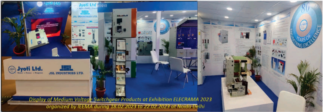
Display of Medium Voltage Switchgear Products at Exhibition ELECHEMA 2023 organized by IEEMA during 18.02.2023 to 22.02.2023 at Noida Delhi