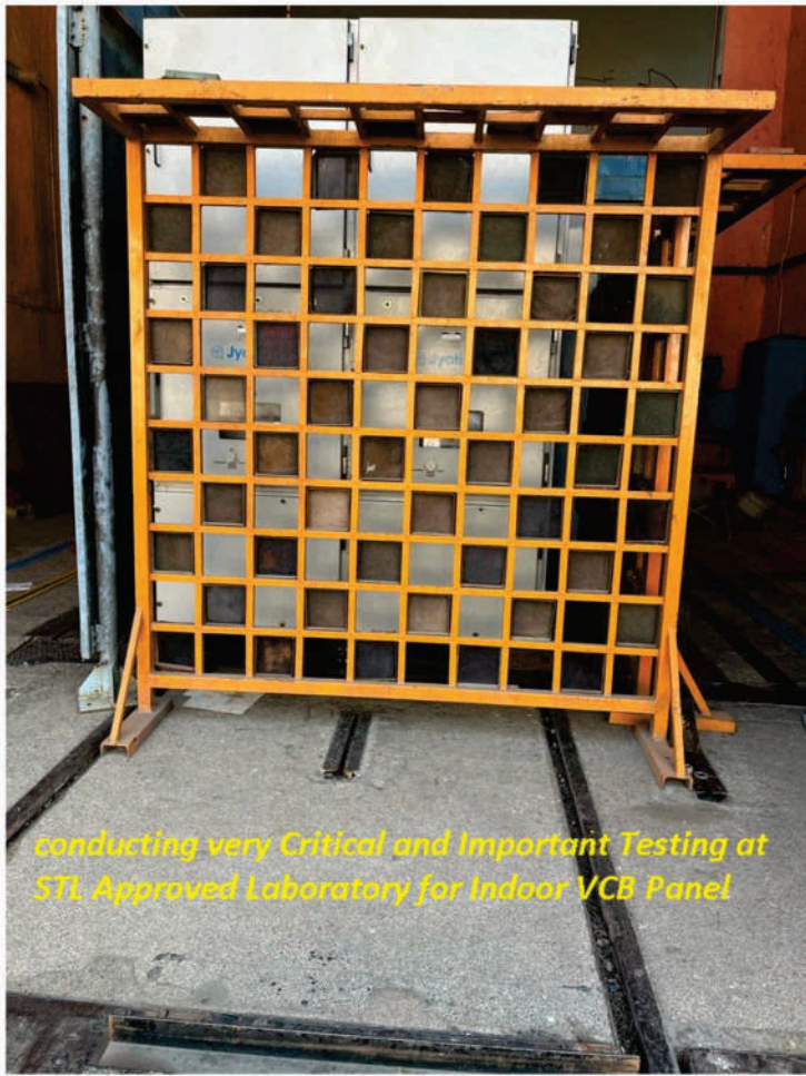
conducting very Critical and Important Testing at STL Approved Laboratory for Indoor VCB Panel